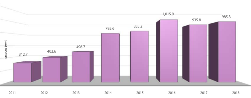
Collection of November 2011 - 2018

Business Permits: Company Annual Fee, Company Registration Fee, Co-operative Society Registration Fee, Co-operative Society Annual Fee, Foreign Business Fee, Foreign Investment Administration Fee, Import Trade Fee, Trade Registry Fee, Restaurant, Café, Canteen Fee, Partnership Annual Fee, Dive school Registration Fee, Guest House Registration Fee, Other Registrations & License Fees, Motor Vehicle and Vessel Registration Fee, Sale of Tender Documents, Bank Mortgage Registration Fee, Sale Traders Registration Fee, Sale of pass Royalties: Duty Free Royalty, Fuel Re-Export Royalty Non-Tourism Property Income: Commercial Land Rent, Government Buildings Rent, Long-Term Agricultural Leased Islands Rent, Rent from Floating Jetty, Uninhabited Islands Rent Proceeds from Sale of Assets: Sale of Government Buildings, Sale of Government Land, Sale of Items at Auction Others: Reimbursement from previous year budget, Sadaqah